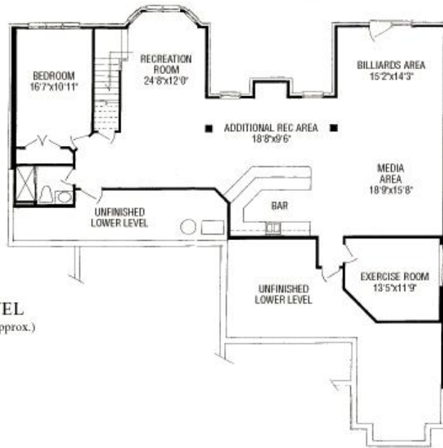
OPTIONAL LOWER LEVEL 1,630 square feet (approx.)

● 9545 Kenwood Road, Suite 401 • Cincinnati, Ohio 45242 • (513) 984-5360 • www.halhomes.com