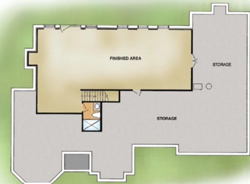
OPTIONAL LOWER LEVEL

In keeping with the policy of continued attention to design and construction details, we reserve the right to modify plans, designs, and specifications. This brochure is for illustration purposes and is not part of a legal contract.