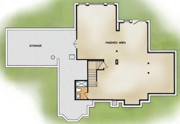
OPTIONAL LOWER LEVEL