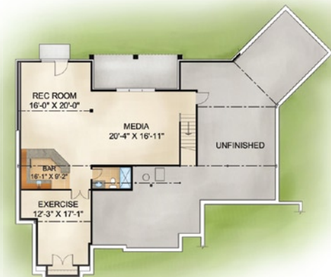
OPTIONAL LOWER LEVEL